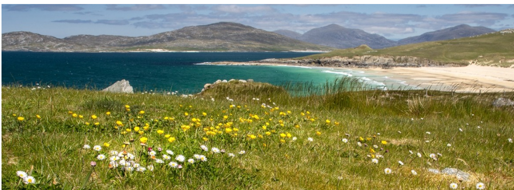
Borve, Harris

Jesus said to them, "Come with me, by yourselves, to some remote place and rest a little".